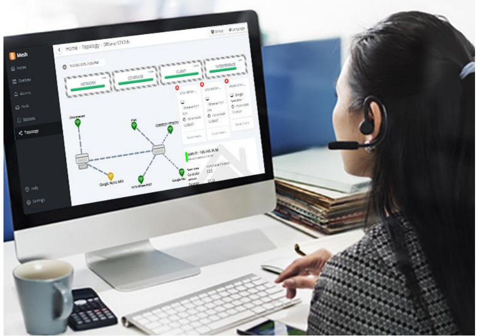
Illustration: SuperStream management tool for ISPs such as InternetTY.

tool for Customer operations, and we are very pleased to make our first deployments of Super Stream with Netgem TV in the UK & Ireland."